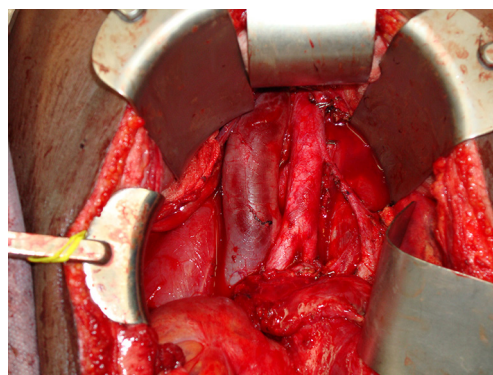
Figure 3 Partial cystectomy secondary to tumor involvement with the left lateral surface of the bladder.

A 26-year-old male presented to the emergency department due to a broken jaw following an altercation. On physical examination, he was noted to have a large intraabdominal mass measuring 13 cm, as well as an empty